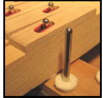
Balance rail bushings