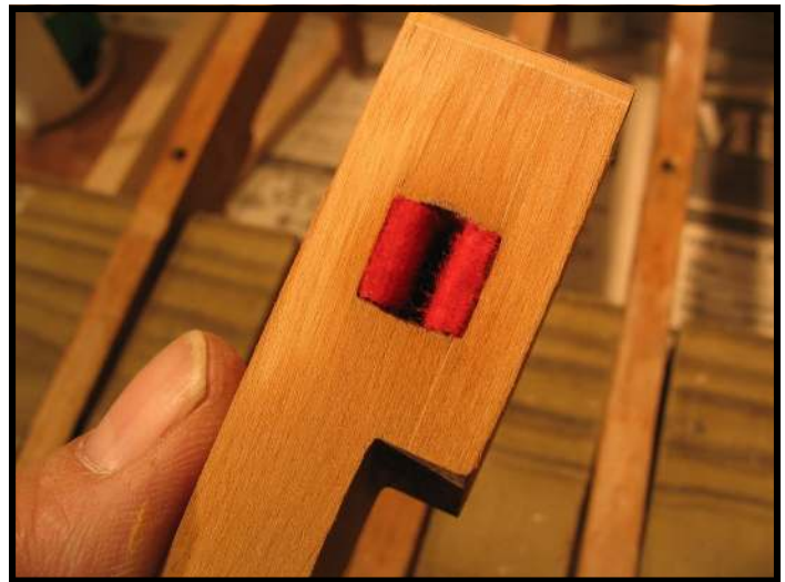
A key which has been professionally rebushed.

Functionality of the Parts: The wooden portion of the key (the "keystick") operates much as a child's teeter-totter. The center of each key rests on the balance rail, which serves as the fulcrum. Two polished "keypins" (front rail pin and balance rail pin) keep the key tracking in a straight line. Felt punchings (the green and white felts in the photos above) cushion the keys from underneath, and felt bushings (the red felts in both photos) help to make sure that each key has a snug fit and is silent in its operation.