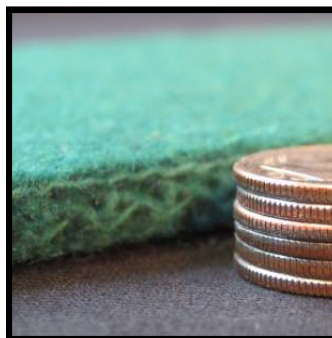
Back rail cloth

As the keybed felts harden and wear thin the keys become uneven in height from note to note. Also the amount of downward stroke (key dip) begins to vary, resulting in an action which has an uneven touch. A perfectly level set of keys with a uniform amount of key dip is essential to a piano action which is performing up to its potential.