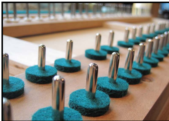
New set of keybed felts in place.

Keybed felts come in a range of thicknesses, so that the original size of the felt installed at the factory may be duplicated. Paper and card punchings as thin as .002" are used under the felts for final adjustments necessary for level keys and even key dip.