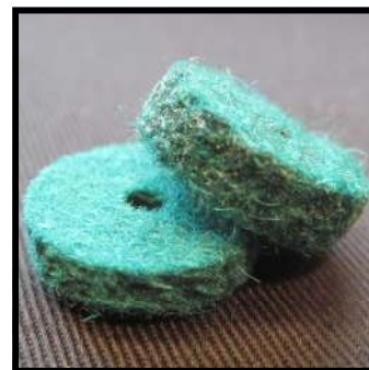
Front rail punchings

The felt used for backrail cloth, as well as the balance rail and front rail punchings, is a very thick, dense felt that is designed to stand up to decades of constant use.